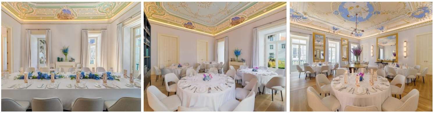
O DRAGOEIRO - BOARDROOM LAYOUT

The hotel's four magnificent event rooms, with large windows and coffered ceilings with handpainted frescoes, are ideal for receptions and banquets in an atmosphere of luxury and distinction and the extensive gardens are an exceptional setting for unforgettable celebrations.